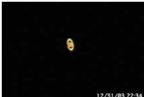
Saturn taken at near opposition Shot with Pentax EI2000 digital camera Afocal through Meade AR6 refractor mounted on LXD55.